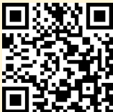
Scan to Download